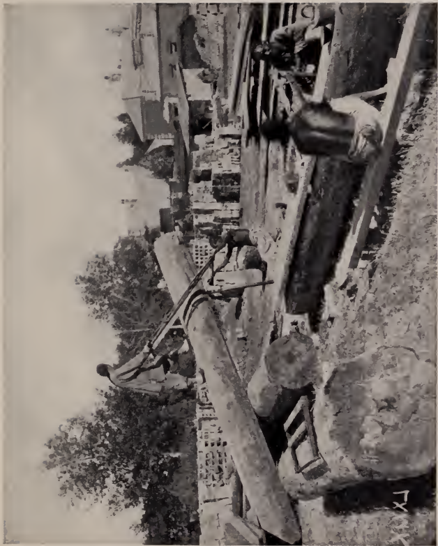
A SAWMILL IN TIENTSIN.